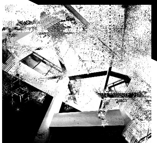
Music by Mix by